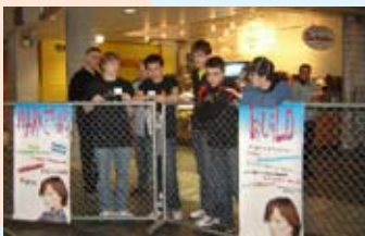
Discovery Program Students at the U of M